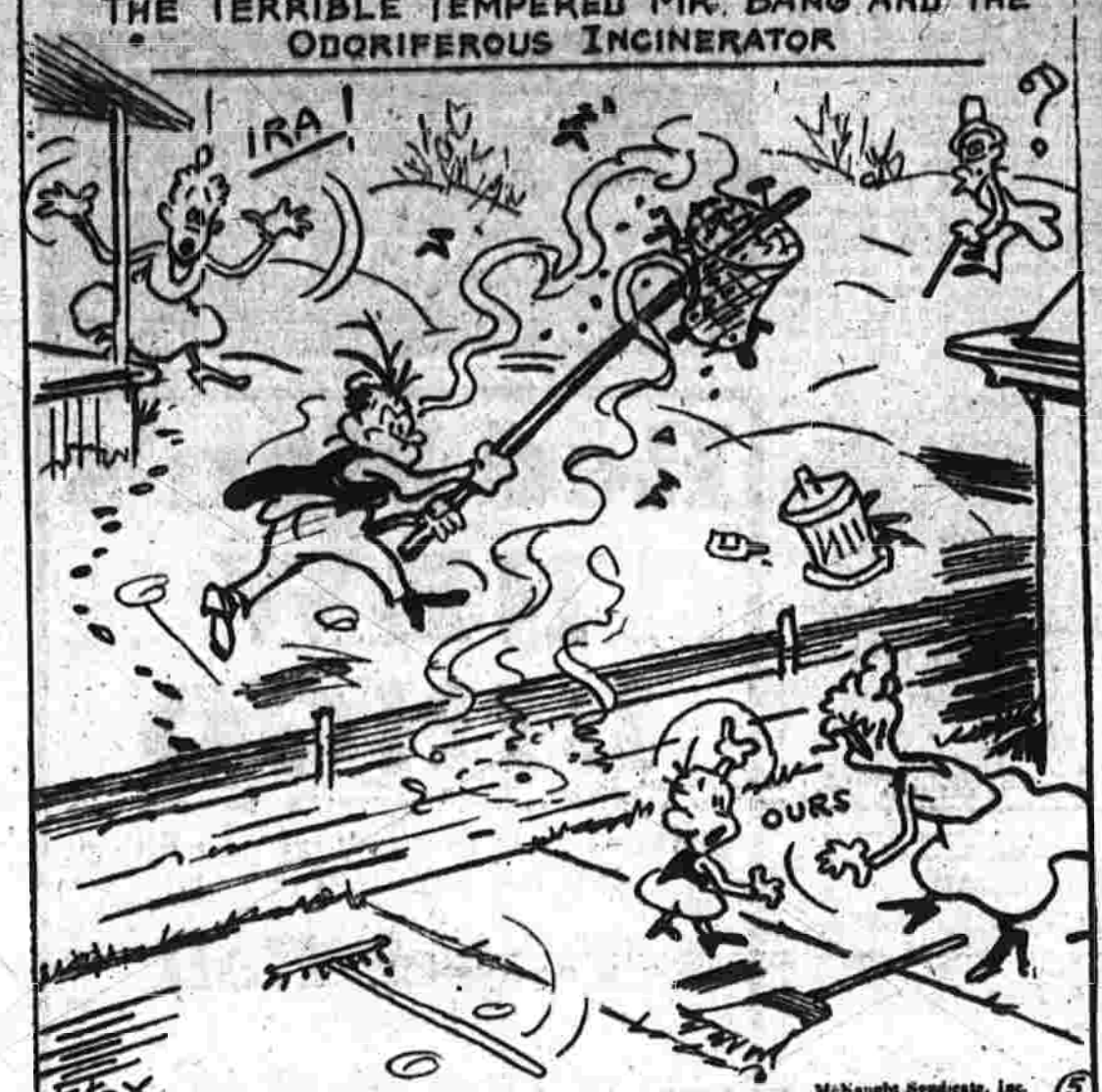
THE TERRIBLE TEMPERED MR. BANG AND THE ODORIFEROUS INCINERATOR